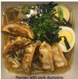
Ramen with pork dumpling