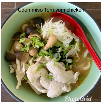
Udon miso Tom yum chicken