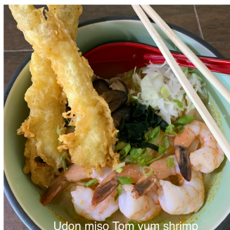
Udon miso Tom yum shrimp