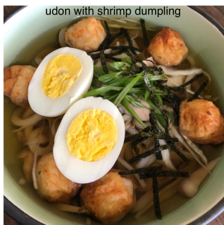
udon with shrimp dumpling